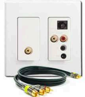
Grand Room A/V wallplate

Wall plate balanced audio receivers convert balanced signal back to unbalanced audio through the wall plate electronics. Simply plug your stereo receiver or entertainment system into the wall jack and the remotely located iPod becomes a source which you can enjoy in the Great room or any where in the house where you have connected amplification and speakers.