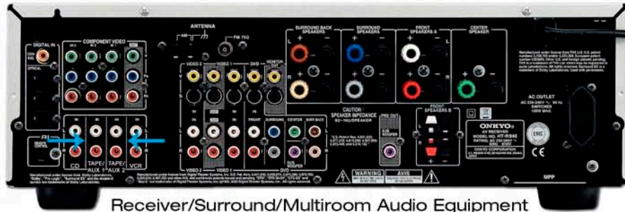
Receiver/Surround/Multiroom Audio Equipment